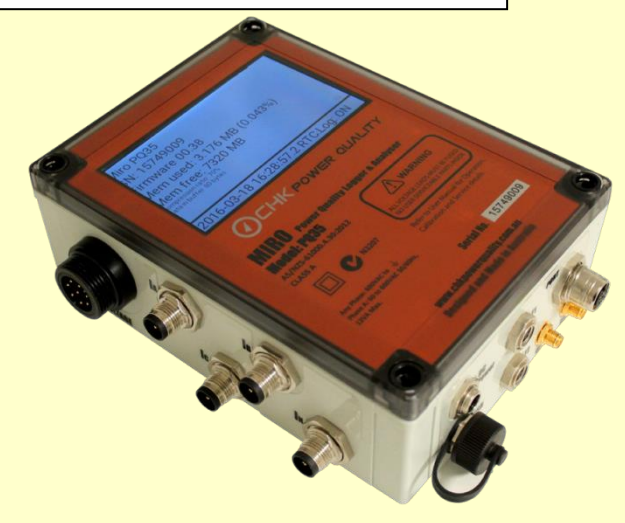
Figure 1: MIRO PQ35 - Three phase power quality logger and analyser