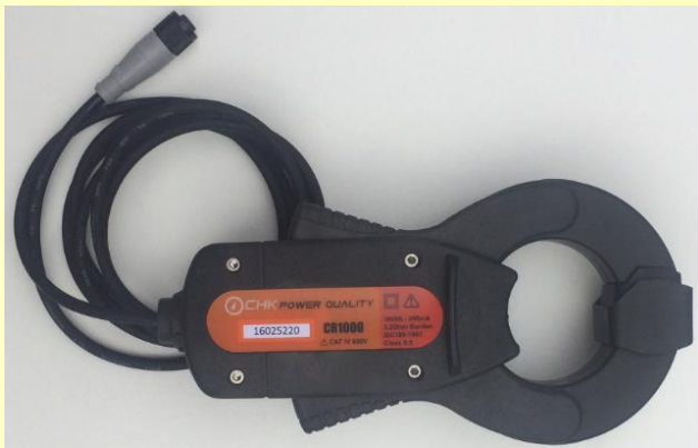
Figure 1: 52 series CAT IV 600V current clamp-on probe

The 52 series is suitable to use outdoors in wet and humid environments.